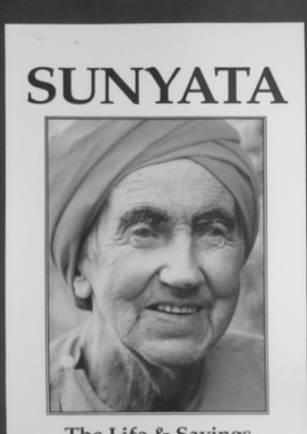
The Life & Sayings of a Rare-born Mystic